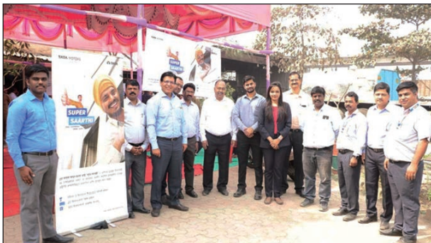
Organized by TATA Motors, BLR Logistiks & Kamal Motors Team on January 21, 2019