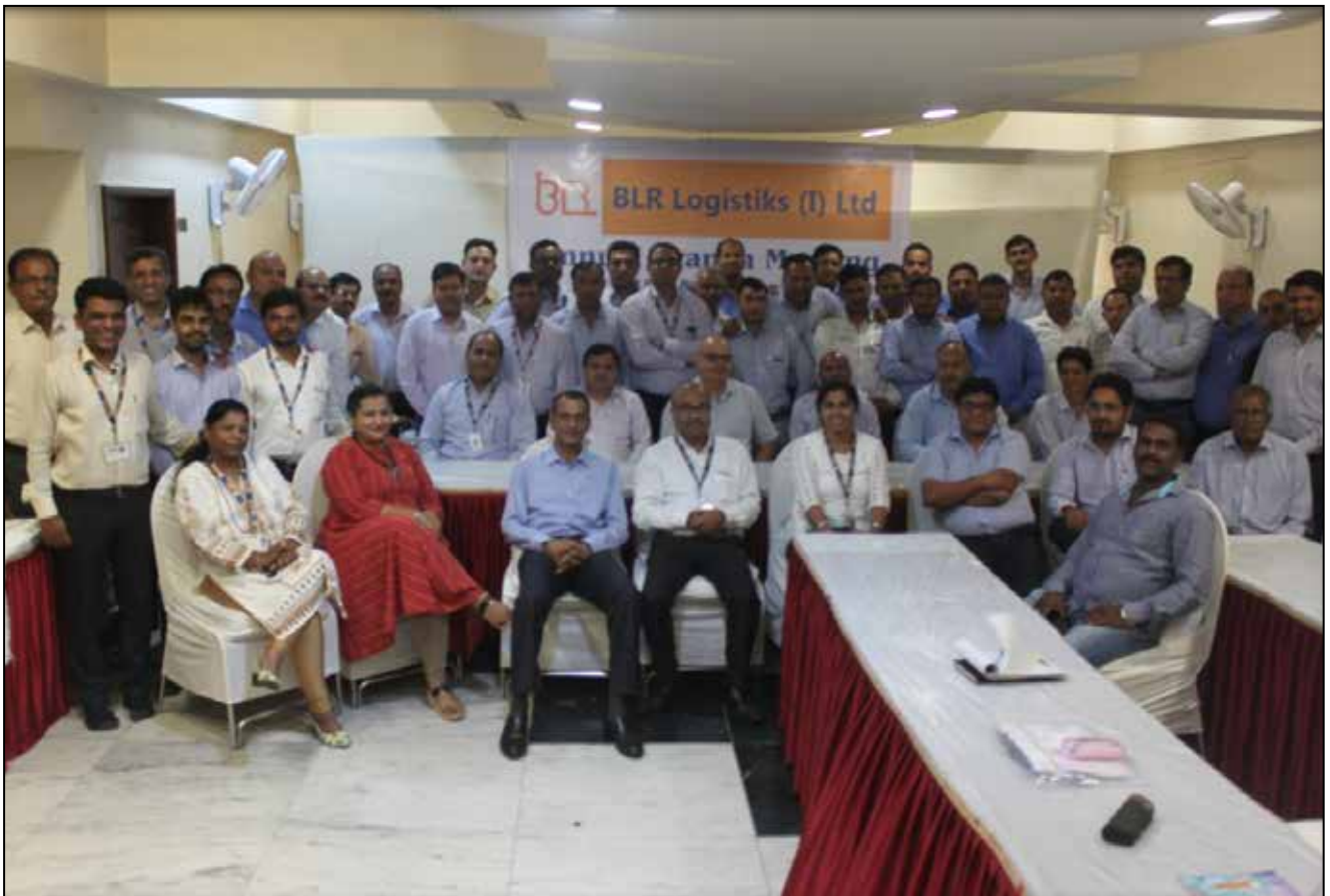
BLR Management Team, Leadership Team and Pan India Zonal Heads & Branch Managers

AGM for Financial Year (FY) 2017-2018 was held on 14th June 2018 to 16th June 2018 at Mumbai where BLR PAN India Zonal Heads and Branch Managers were invited for performance review meetings, branch wise.