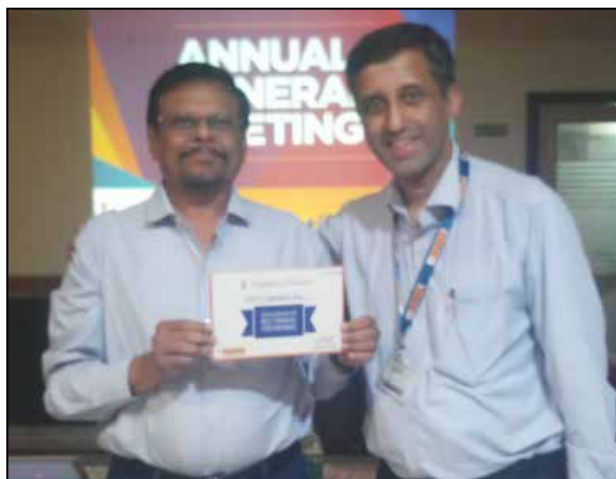
Maharashtra Zone for Best Financial Performance