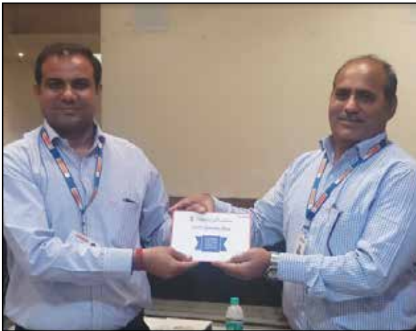
Gandhidham Branch for Best Efforts in Credit Control