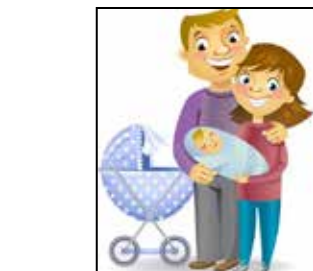
Maternity & Parental Benefits