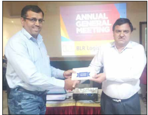
Bharuch Branch for Best Accounting Practices