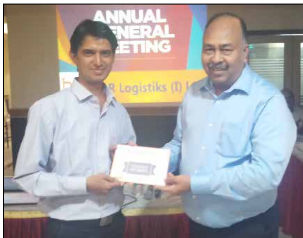
Goa for Best Branch of BLR