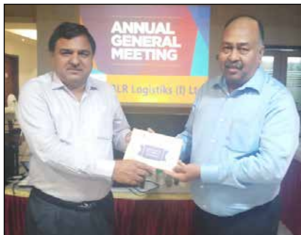
Mumbai for Best Financial Performances