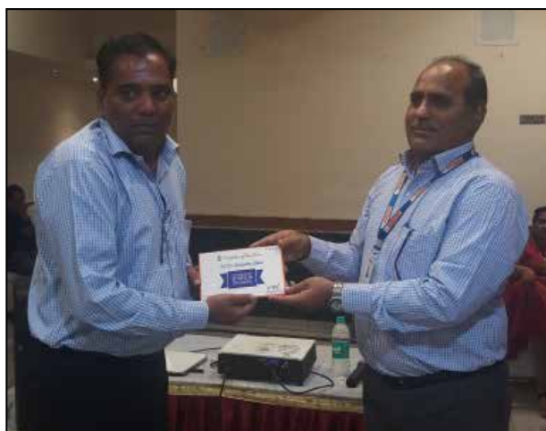
Aurangabad Branch for Best Efforts in Cost Control