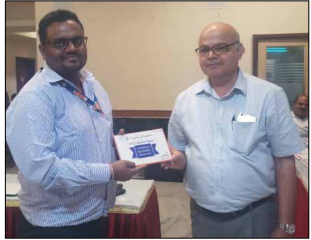
Bangalore Branch for Best Performance in Customer Acquisition