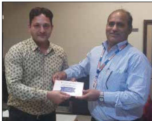
Logistics Division - Delhi for Best Efforts in Cost Control