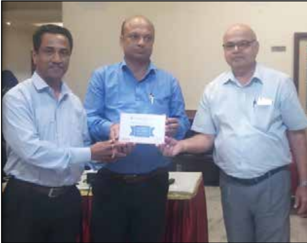
East Zone for Best Performance in Customer Acquisition