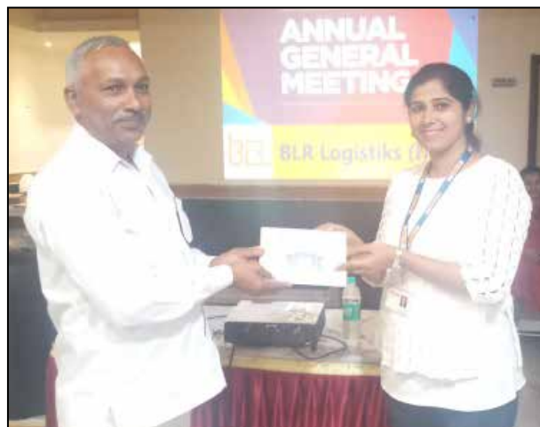
Shirwal Branch for Best Improvement in Performance